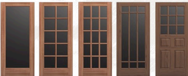
K-6010 K-6020 K-6080 K-6090 K-6510