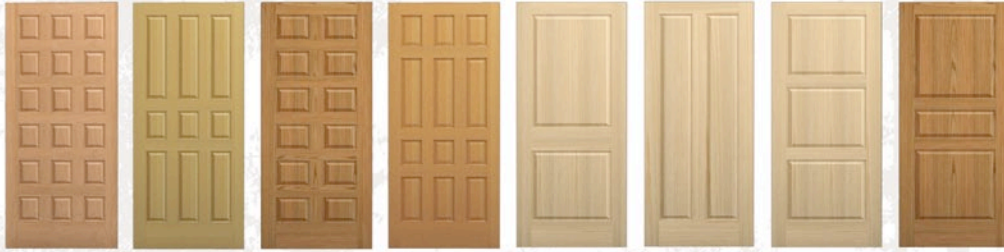
K-3180 K-3190 K-3220 K-3320 K-4010 K-5020 K-5300 K-5310