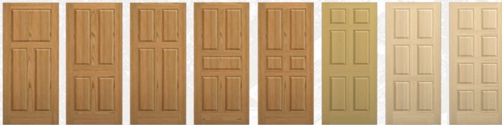
K-5320 K-5400 K-5410 K-5500 K-5600 K-5610 K-5660 K-5810