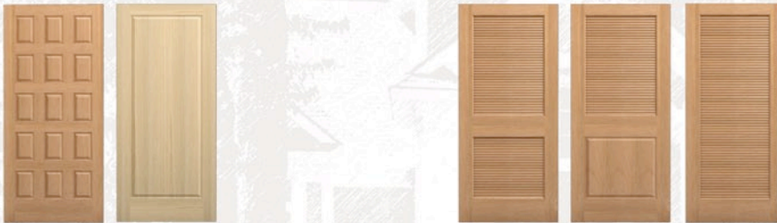
K-5930 K-6000 K-7300 K-7320 K-7330