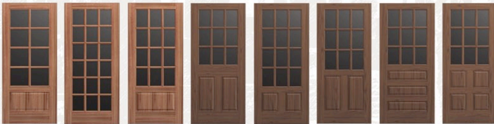
K-3580 K-3600 K-3700 K-3750 K-3800 K-3820 K-3830 K-3840