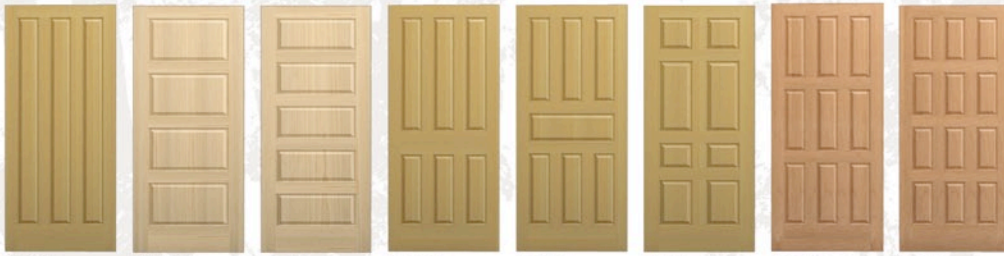
K-3030 K-3040 K-3050 K-3060 K-3070 K-3080 K-3090 K-3120